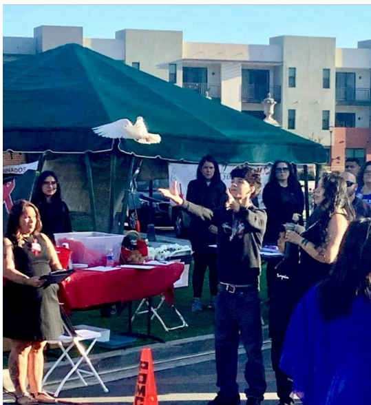
Families honoring loved one